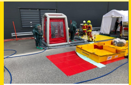
Leakage of ammonia from a cooling machine in a factory building