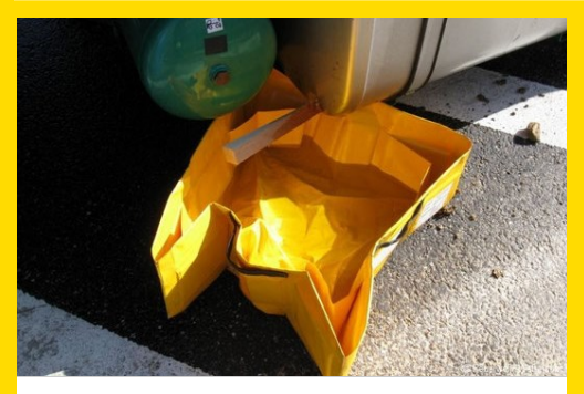
Truck tank slashed