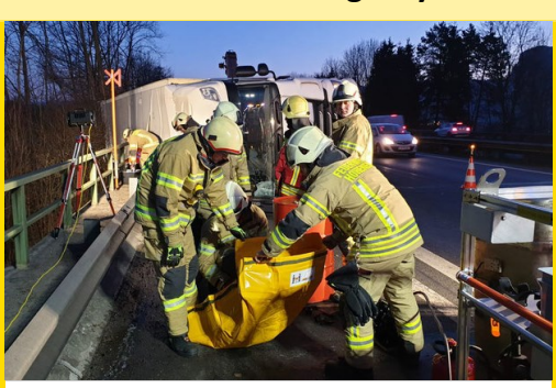
Accident with hazardous goods on the highway A2