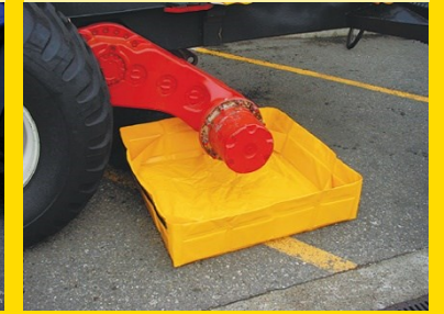
Cases of emergency